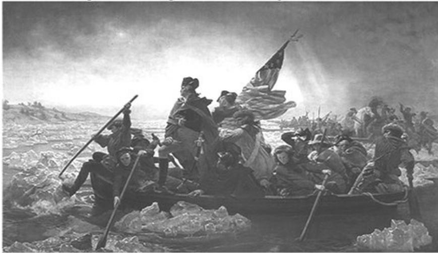
Washington Crossing the Delaware by Emanuel Leutze

Historian 1 concluded that this historic crossing made Washington a hero to the people of the United States. Historian 2 concluded that Washington and his men crossed the Delaware on a freezing night.