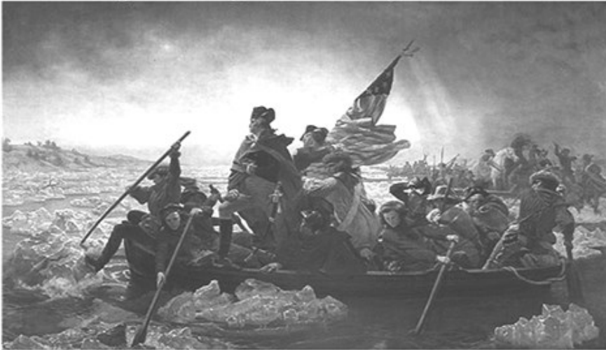
Washington Crossing the Delaware by Emanuel Leutze

Historian 1 concluded that this historic crossing made Washington a hero to the people of the United States. Historian 2 concluded that Washington and his men crossed the Delaware on a freezing night.